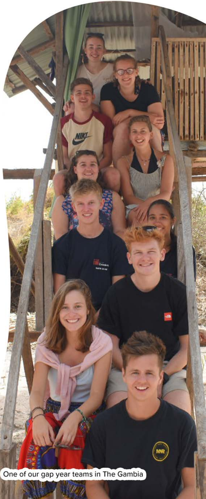
One of our gap year teams in The Gambia

Visit crosslinks.org/short-term for more details. We look forward to hearing from you soon.