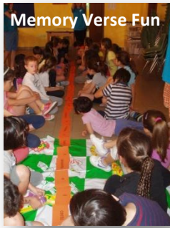
Memory Verse Fun