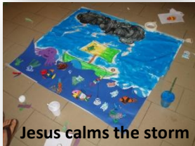
Jesus calms the storm