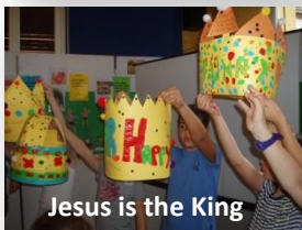
Jesus is the King