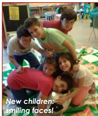
New children: smiling faces!

We worked in our weaknesses in tough group study times; with language, with age (many of the children were "littlies" being only 6-7 years old) and with sheer hard-hearted stubbornness. BUT, consistency had built trust and honesty, making these times far more real this year. There were those who had refused to open Bibles in the past, yet did so when asked. There were those who scrutinized the Scriptures and gave us mixed