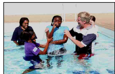
A cold dip!