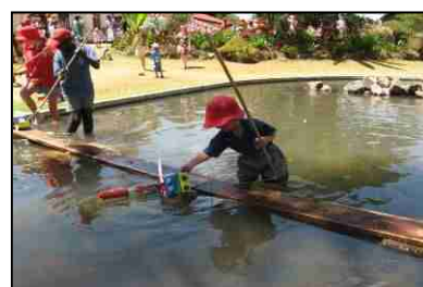
A whole afternoon driving the “Dinky safari” course!

Thank you for your love, support and prayers,