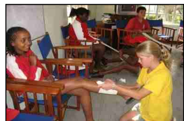
Mary's teaches First Aid...